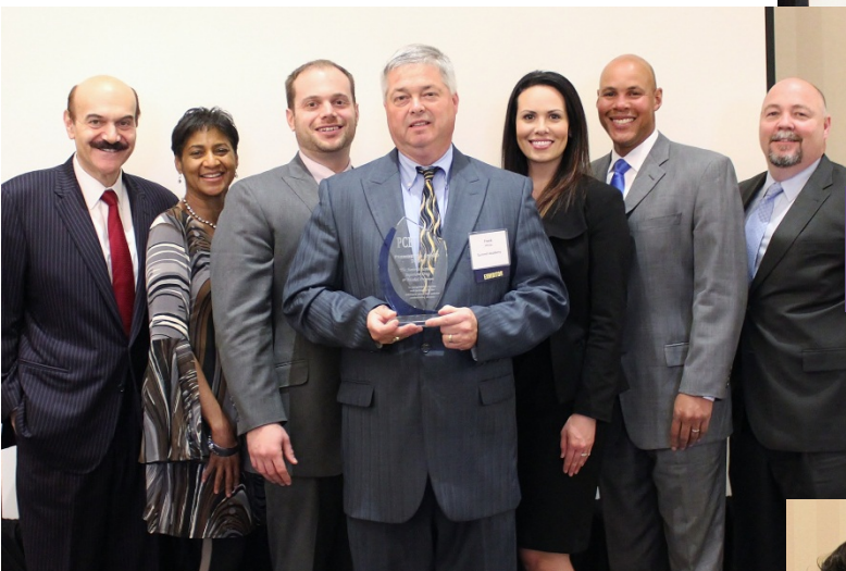
Pictured Left: Representatives from The Summit Academy present to accept the President's Award.